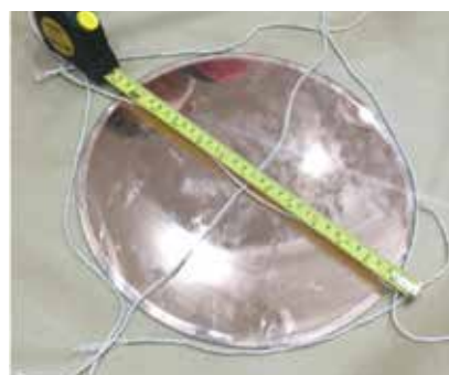
Figure 6: Measuring the diameter through the centre.

two. Secondly, Nicola introduces a procedure to use a square to find the centre of a circle. That this works for any circle is also a theorem. As Nicola notes, the children revelled in the results of their hard work and their new knowledge that they could apply to any circle. The third 'theorem' stemmed from the children's discovery: as long as you measure through the circle's centre, the distance from one edge to the other will be the same in any direction. In this, the children were touching upon exactly what distinguishes a circle from any other shape.