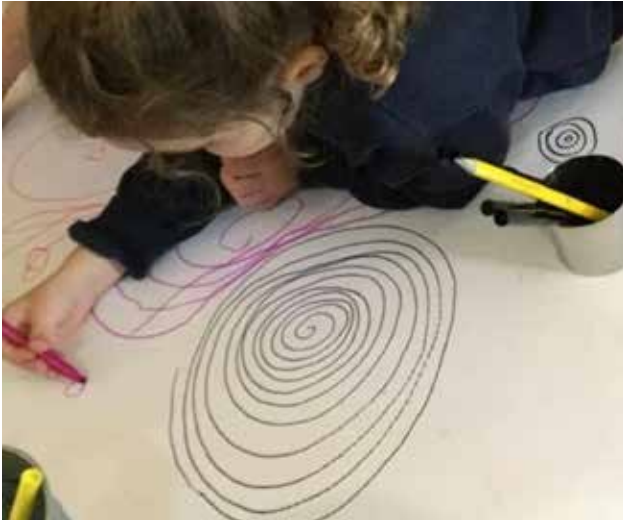
Figure 2: Using drawing to compare concentric circles and spirals.

The children were then given sheets of acetate, so that their drawings could be projected onto the wall. They began to explore properties like orientation, size, medium, colour and so on, and to talk about one another's drawings and ideas as they worked. This touches on an idea that came up frequently in the discussions between the mathematicians and the teachers: sameness. Determining in which ways two objects, numbers, shapes, statements etc. are the same, or under what conditions they can be considered the same (or logically equivalent), is an important area of mathematical thought that is often lacking in school aged children. Is a spiral drawn starting anti-clockwise 'the same' as one drawn starting clockwise, for example? Does it matter whether the shape is seen on paper, on acetate or on the wall? Here, the children are thinking about how a particular shape is defined, and what are its necessary and sufficient properties.