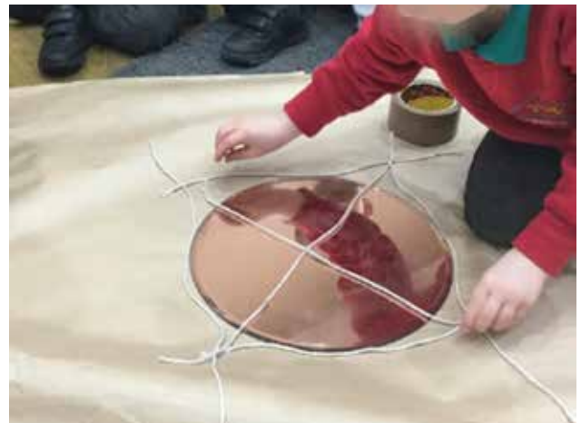
Figure 5: Using the 'square' method to find the centre of the circle.

The goal for this session was to revisit some earlier concepts about circles, and to move on to thinking about the centre point of the circle. Nicola had prepared a collection of circular objects in advance of the children's arrival ready to support the exploratory conversation.