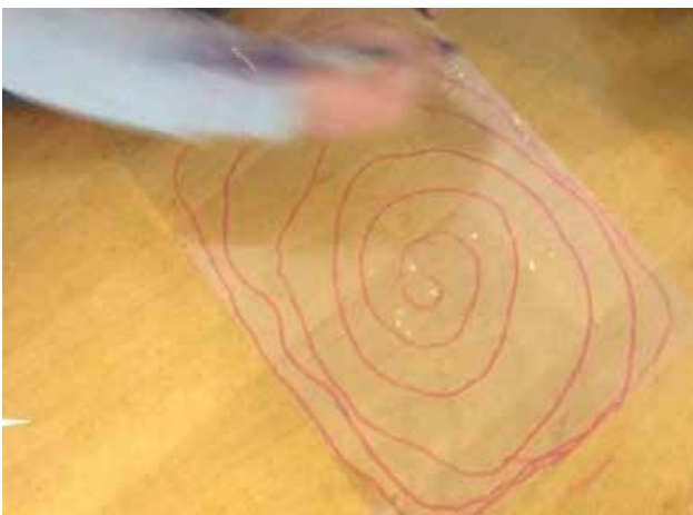
Figure 3: Drawing a spiral on acetate, ready to be projected.

The children were then given sheets of acetate, so that their drawings could be projected onto the wall. They began to explore properties like orientation, size, medium, colour and so on, and to talk about one another's drawings and ideas as they worked. This touches on an idea that came up frequently in the discussions between the mathematicians and the teachers: sameness. Determining in which ways two objects, numbers, shapes, statements etc. are the same, or under what conditions they can be considered the same (or logically equivalent), is an important area of mathematical thought that is often lacking in school aged children. Is a spiral drawn starting anti-clockwise 'the same' as one drawn starting clockwise, for example? Does it matter whether the shape is seen on paper, on acetate or on the wall? Here, the children are thinking about how a particular shape is defined, and what are its necessary and sufficient properties.