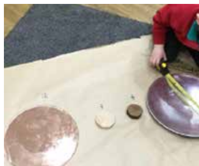
Figure 7: Henry's collection of circles to measure.