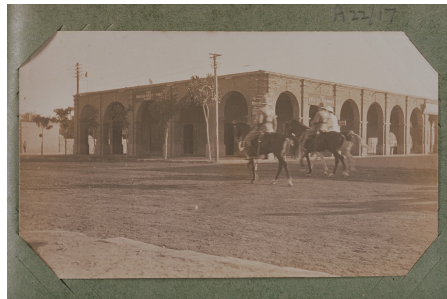
Governor-General, Sir Reginald Wingate, passing the English Pharmacy store during a horseback tour of Khartoum with an unidentified visiting government official or dignitary, 1905 x 1907.

Eleven months and eight days after the Hornbys' arrival in Khartoum, a new store, imaginatively named the English Pharmacy, opened in the city's newly revived commercial center. Amidst the imported goods, customers could purchase a postcard from the house line, Morhig Photos. This line of images even included some of the railway station, offering an opportunity for a stock image to fill the void of an absent snapshot. Postcards played an important role in this commercial project, as visual evidence from the early years of the Anglo-Egyptian Condominium demonstrates. 3 This, thanks to one photograph taken of the former American President Teddy Roosevelt's son, Kermit. In 1909, President Roosevelt, his son Kermit, and a large force of American naturalists and big game hunters traveled to Sudan as part of an East African collecting trip supported by the American government through the Smithsonian Institution. During their stay in Khartoum, Kermit went to the English Pharmacy in the booming reconstructed capital of Khartoum where he posed for a photograph.