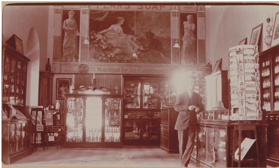
Theodore Roosevelt's son buying postcards in the English Pharmacy store owned by G. N. Morhig, during Roosevelt's visit to the Sudan whilst on a hunting tour of East Africa, 14 x 17 March 1910. R. von Slatin collection, Sudan Archive Durham (SAD.A44/90).

In this photo Kermit stands smartly dressed, gently leaning against the wood and glass cabinet partly blocking a round display of postcards with another in the foreground. These display cases held the Morhig Photos line of postcards that included hundreds of different images printed and sent across the imperial world of the early twentieth century. While there were several printers of postcards in early twentieth-century Khartoum, Port Sudan, and Suakin—the Gordon Stationary, the Sudan Times, Karakashian Bros, and others—the Morhig line stands out because of its large range of images available during the Anglo-Egyptian Condominium. Even today, many