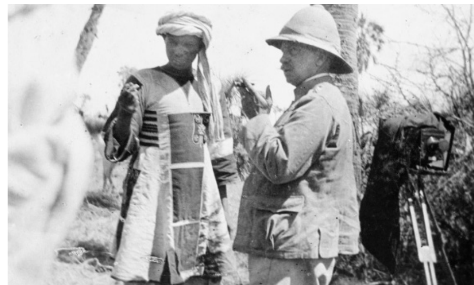
Sir Reginald Wingate (standing next to a camera) questioning the captured Mahdist amir Mahmud Ahmad, wearing a blood-stained jibbah, after the battle of the Atbara, 8 April 1898. F.R. Wingate collection, Sudan Archive Durham (SAD.A27/26).

Chicago's Cairo Street. It also points to the imbricated nature of photography within these contexts. One of the most popular shops on the street was the photography studio of G. Lekegian, the Armenian-Egyptian photographer whose sign states his status as "Photographer to the Khedive" on Cairo Street, Chicago, but whose popular studio in Cairo, Egypt—located near the popular Sheppard's Hotel—advertised as being photographers to both the Egyptian Army and British Army of Occupation. 25 The Lekegian souvenir scrapbook, sold at the Fair, itself includes images of "Busherin Warriors", standing in front of this custom-built Cairene Street. 26