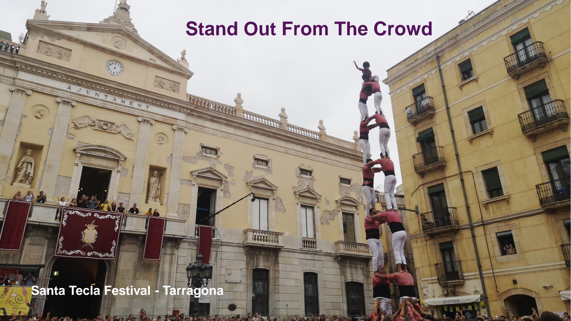
Santa Teclà Festival - Tarragona