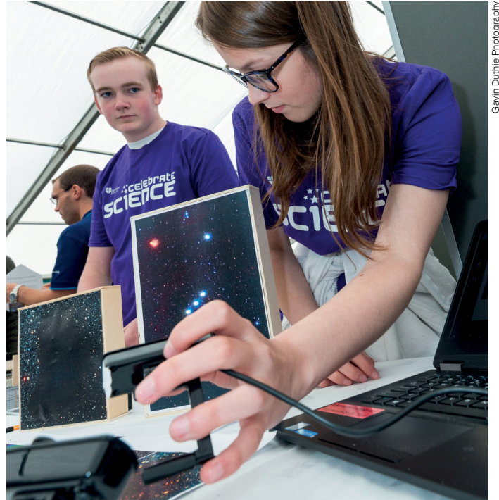
Figure 4 (right). Students of a local school engaging with the public at the Celebrate Science festival in Durham (UK) to explain the benefits of using infrared light for astronomy.