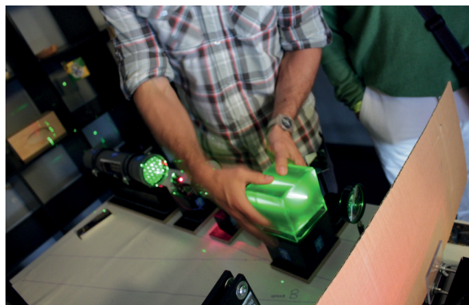
Figure 2. Hugo Messias, an ESO Fellow in Vitacura, presenting the telescopes workshop to visitors of the Lake Alqueva Observatory (OLA) in Portugal. The equipment is being kept at the observatory for use by future visitors.

a. Telescope designs: This workshop uses a series of lenses, mirrors, light-emitting diodes and a “laser cannon” to showcase how refracting and reflecting telescopes work (see Figure 2). The Ambassadors also use this activity to explain the different designs of various ESO telescopes.