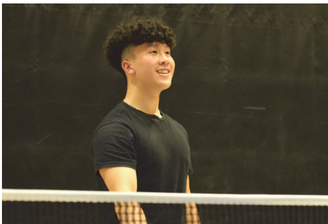
SP student enjoying table tennis (above) Durham Student Ambassador smiling at the camera (right)

Though we do not anticipate any major changes, please note the details of the eligibility criteria are based on the 2023 programme and are subject to change.